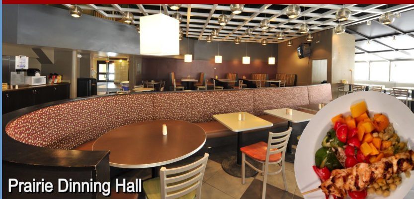
Prairie Dining Hall

Once you get your ID Card, you're ready to eat! Tap your ID Card at the cash and the appropriate amount will be deducted from your plans.