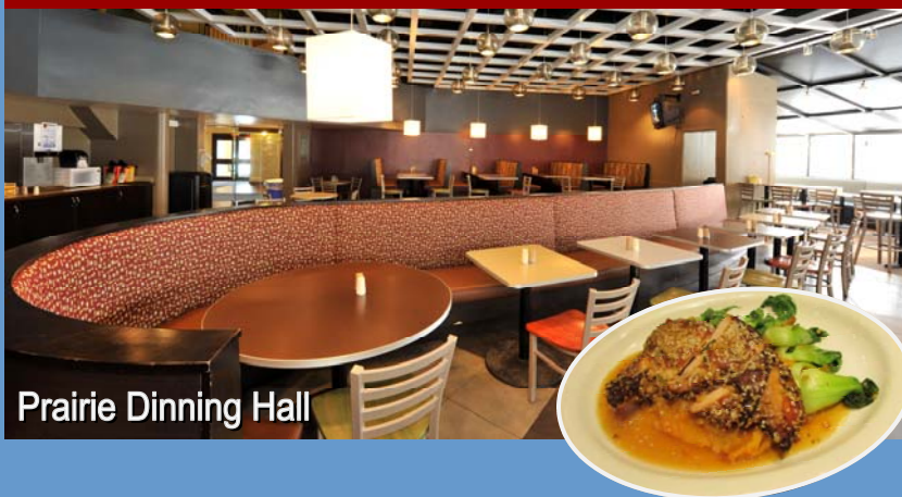
Prairie Dining Hall

Once you get your ID Card, you're ready to eat! Tap your ID Card at the cash and the appropriate amount will be deducted from your plans.